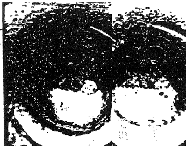
Q2627 (M0820 mm)