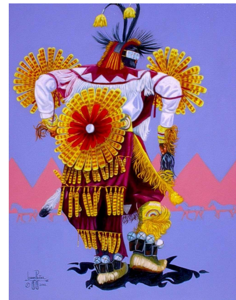
I Dance With the Spirit of the Horse (2003)